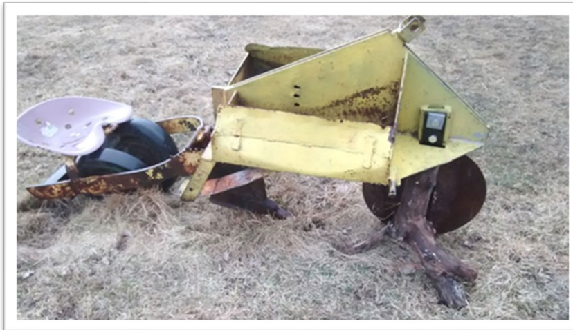
Photo of an open-land tree planter, removed from the tractor

On the day of the incident, four Texas A&M Forest Service employees were working in the Fairchild State Forest as part of their routine job duties. The crew was moving a John Deere 5400 farm tractor with an open-land tree planter attached to the rear three-point hitch. The operator of the tractor was having difficulty shifting and getting the tractor into gear. They stopped, turned off the tractor's engine, and let the front-end loader bucket down to rest on the ground.